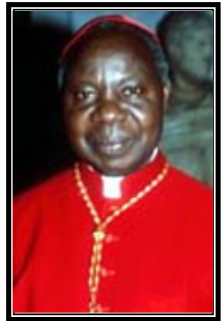
H.E. Emmanuel Card. Wamala, Archbishop Emeritus of Kampala

The Synod ends today. We pray that it's goals are achieved